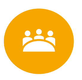
Program Administration and Physical Inspection (PAPI)

The Executive team establishes departmental strategic direction. The Strategic Solutions team serves as an implementation driver through consultative services to the core business unit teams of Project Operations Compliance, Portfolio Analysis, and Program Administration and Physical Inspection who focus on operational, financial, programmatic, and physical compliance, respectively. This work is pursued in accordance with three core values - Communication, Accountability, and Consistency.